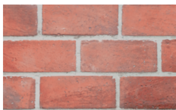
056 Brick Garda