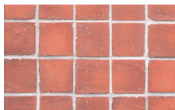
057 Brick Piccoli